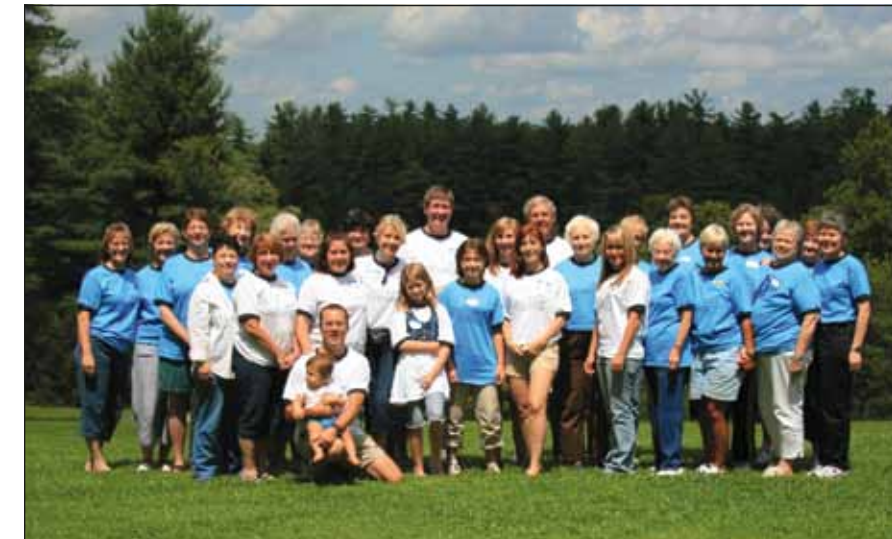
"As a breast cancer survivor myself, I saw how Camp Liberty gave everyone a welcome break from their worries about cancer. People who've had cancer share a special bond. At camp, this camaraderie was so strong that we came away feeling like a family. And we're all looking forward to attending next year."